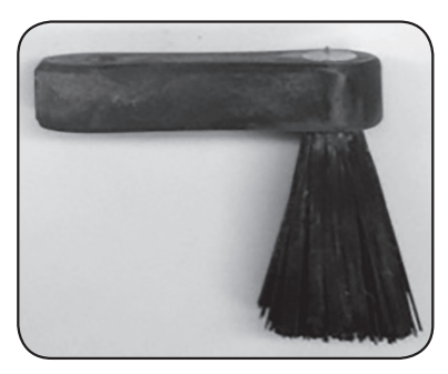
Level 3- Excessive splay, replace to prevent stalling of wiper

NOTE: It is not recommended using wiped C/T in conjuction with EXO Ammonium, Nitrate, or Chloride electrodes as they are protected with a guard which accelerates the brush splay.