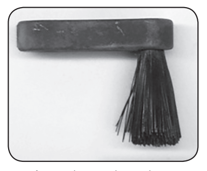
Level 2- Moderate splaying, have spare ready