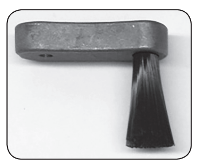
Level 1- New brush, minimal "splay"

Your new sensor includes a new wiper central wiper brush (599673). A brush's wear and replacement intervals vary greatly based on specific application challenges, but 2-12 months use has been observed. Below are three examples of brush wear that will occur naturally over use. It is recommended the wiper brush be replaced before it reaches level 3 for optimal cleaning. We recommend using a new wiper brush with the initial deployment.